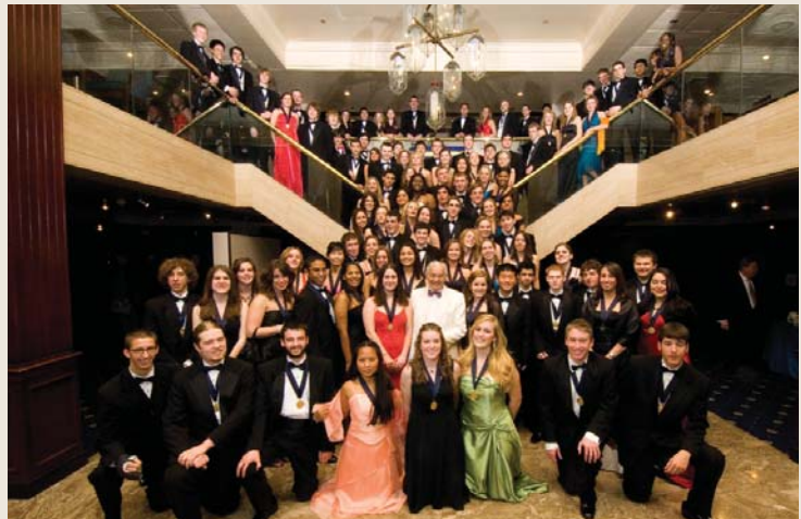
Al Neuharth with the 2006 Free Spirit Scholars at the National Press Club.